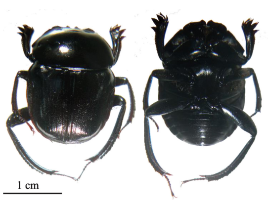
Figure 2. Paragymnopleurus maurus

Primate and Dung Beetle Interaction in Langkawi Island