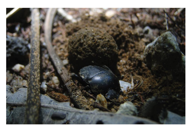
Figure 1. Dung beetle Paragymnopleurus maurus making a dung ball and ready to roll it to other places

beetles of the species Paragymnopleurus maurus (Figure 1 & Figure 2) consumed primate faces as their main food source from this area.