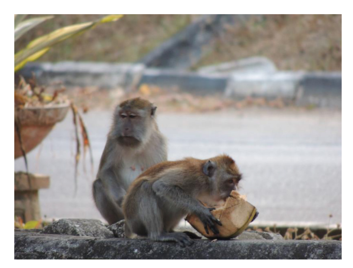
Figure 4. Macaca fascicularis (Long-tailed macaque) enjoying food in Langkawi Island, Kedah, Malaysia

sequence obtained from the PCR product had 98% specificity to the database sequence of M. fascicularis , agreeing with the Max Identity and an E-Value \leq 0 . The specifically designed primer successfully amplified the targeted loci, and the overall molecular approach confirmed that the faces rolled by P. maurus on Langkawi Island belonged to a single species, M. fascicularis (Figure 4).